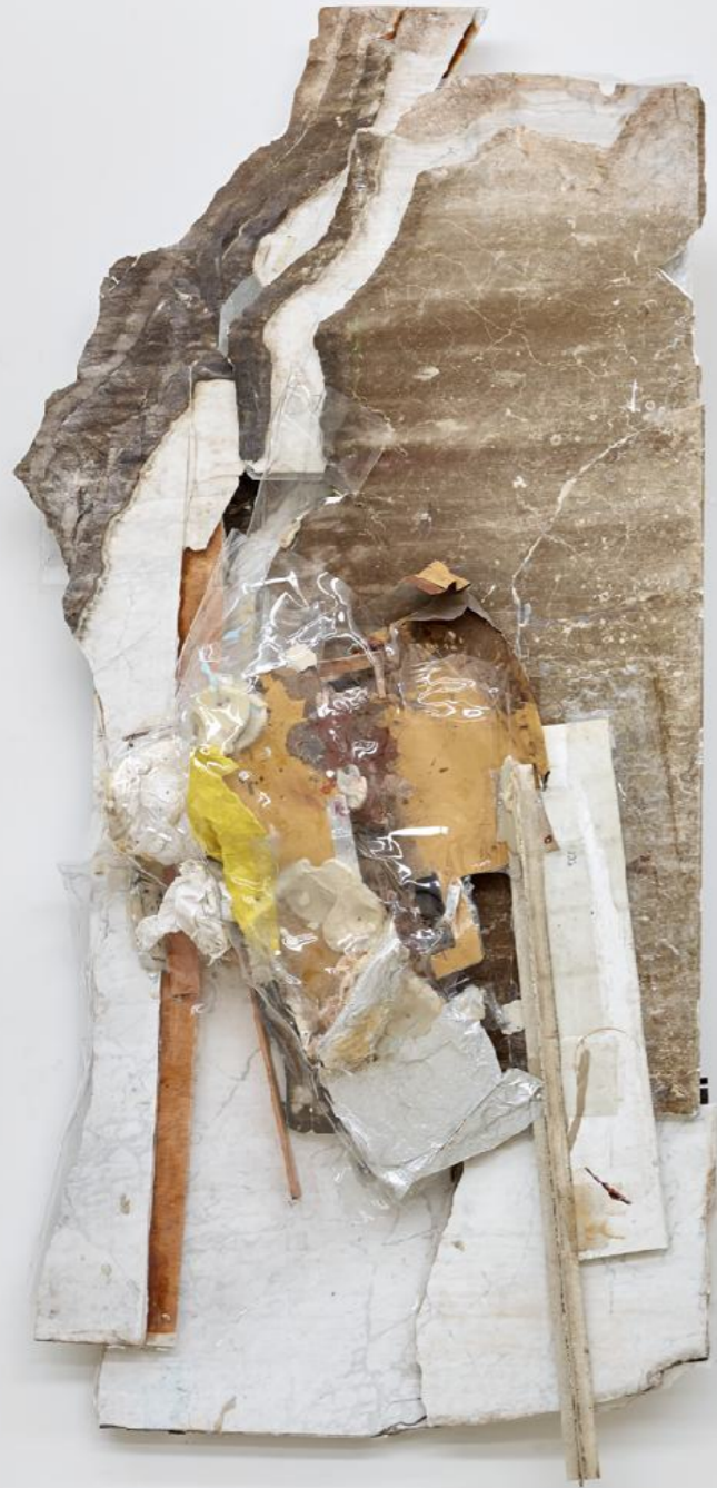
I am the Tablet , 2023, Axel Vervoordt Gallery, Kanaal, Wijnegem, Belgium.

With the latest series, King Louie , Buggenhout refers to a similar destructiveness, but also to a loss of originality through apocryphal additions. Seen today as one of the best-known characters from the Disney adaptation, King Louie did not appear in Rudyard Kipling's Jungle Book – orangutans do not even occur in India, where the story is set. For Disney, the character was a vehicle to project doom, embodied by a clumsy ape with self-centred and chaotic personality, working against himself and others but hopping to tones of New Orleans jazz and swing.