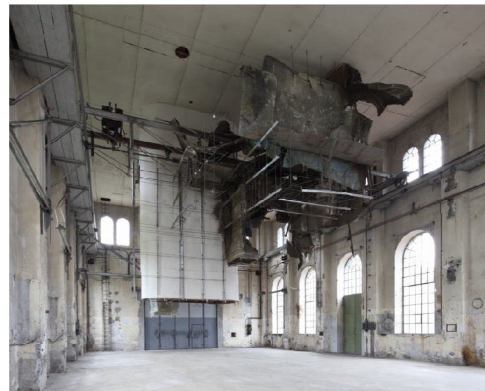
Caterpillar logic , 2010, Kunstraum Dornbirn, Austria.

A leitmotif in Buggenhout's work is human over-consumption, over-accumulation, decadence, the West's protagonist feeling, impermanence and the digital dominance and rapid succession that results in a loss of attention and of the willingness to devote time. It is the latter that Buggenhout asks for as an artist, making sculptures that can only be mentally reconstructed in their entirety, after dedicating time and effort to comprehend. That dedication also reveals that despite the carefully constructed, confrontational, and uncomfortable disorder, the works also offer a stillness, a peace in their indeterminacy. It is as if the efforts spent in trying to understand the works result in a kind of compassion, perhaps even empathy.