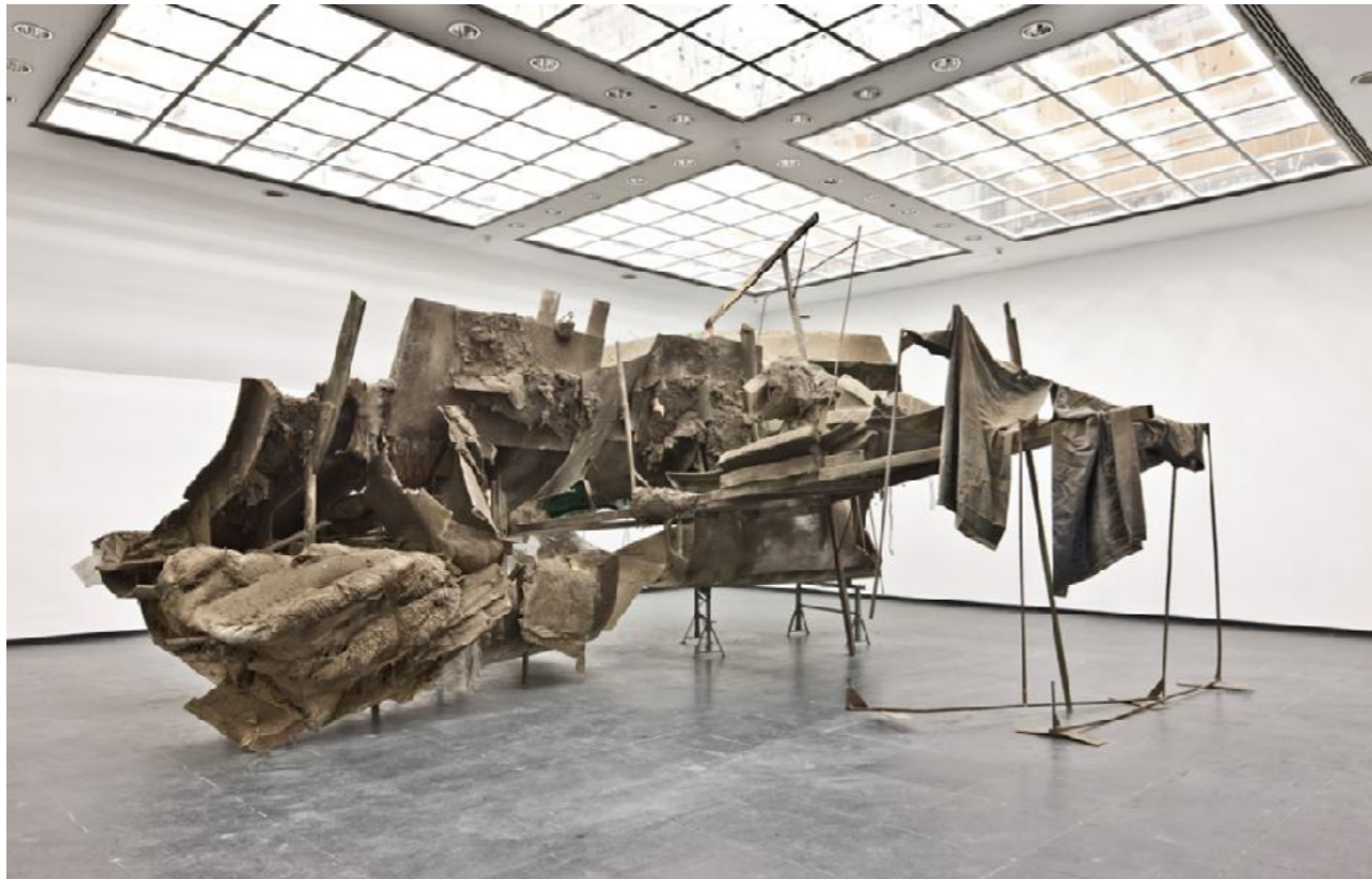
On the Metaphor of Growth , 2011, Frankfurter Kunstverein, Frankfurt am Main, Germany.