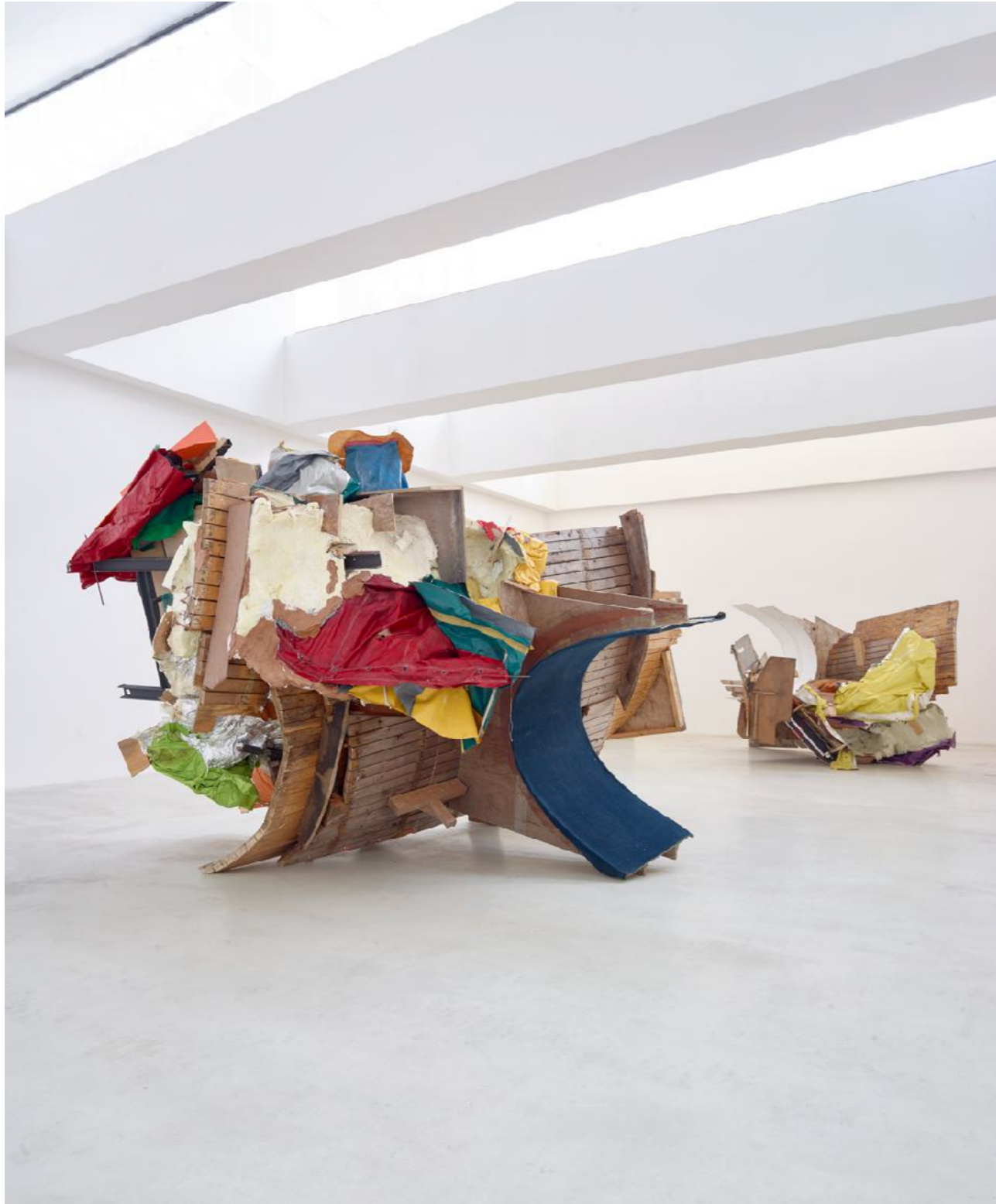
... use menace, use prayer... (part II), 2019, Axel Vervoordt Gallery, Kanaal, Wijnegem, Belgium.

In Mont Ventoux , Buggenhout refers to the very first description of a mountain climb, written by Petrarch in 1336. At the apex of Mount Ventoux, he cast his glance across the nature that had been overcome, pulled out his copy of St. Augustine and began reading about the sins of visual desire. The epochal link of aesthetic and contemplative views, triggered by this new experience of the world, is also reflected in this group. Buggenhout amplifies the sensory impressions using various materials, forms, colors, and surfaces: bleached animal guts, painted and raw artificial materials, cardboard, metals and wood form open and block-like complexes that offer new views from every perspective. Since these groups in particular demand to be viewed while moving, Buggenhout created for the mid-sized format Mont Ventoux pieces plinths. As part of the artwork, they appeal to the beholder to explore the variety of the world in miniature by walking around the work in the alternation of silhouettes and individual shapes.