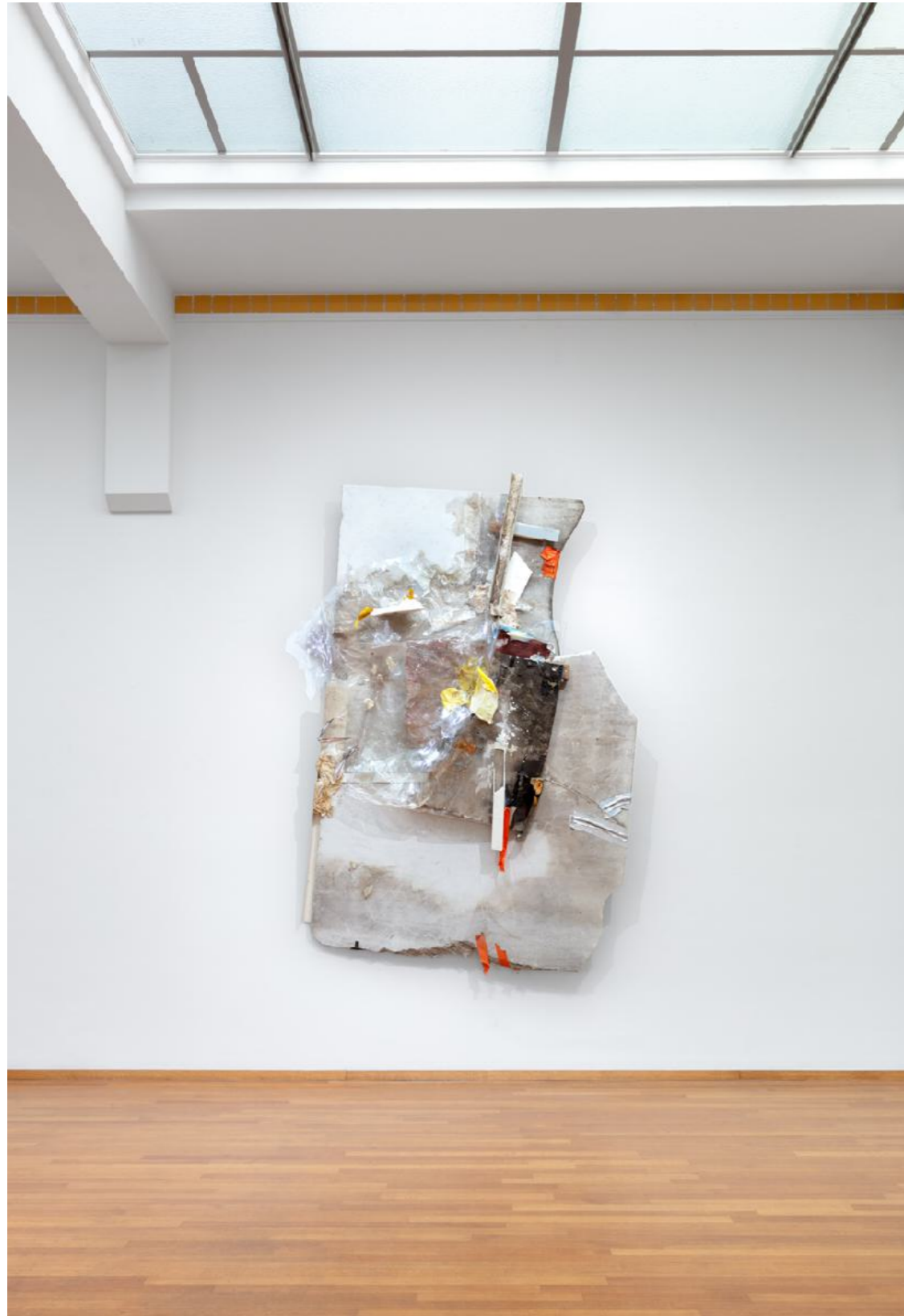
Second Sight , 2024, Kunstmuseum Den Haag, The Netherlands.