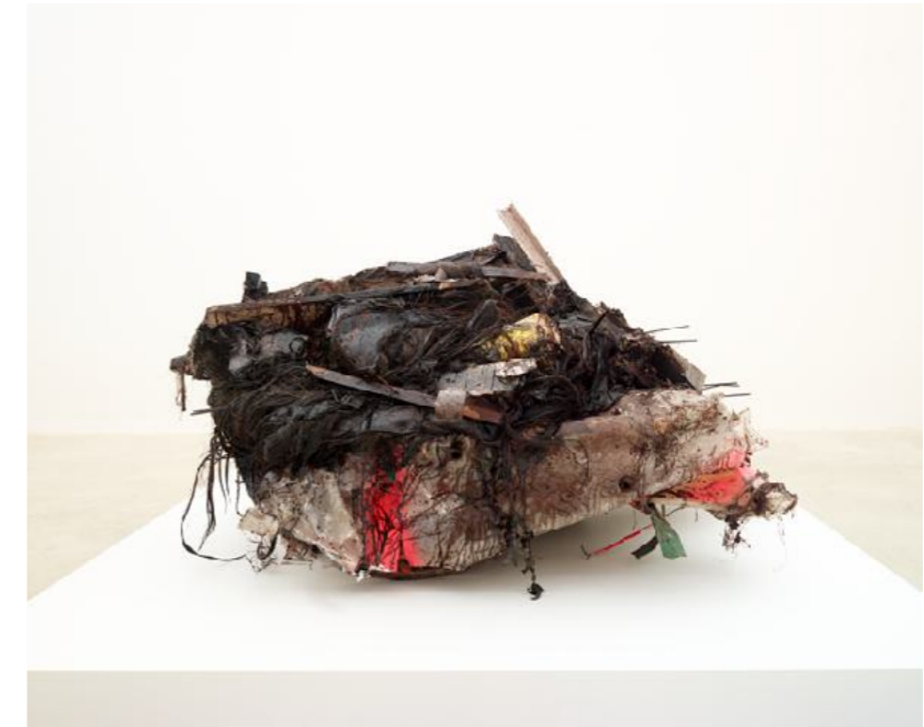
... use menace, use prayer... (part II) , 2019, Axel Vervoordt Gallery, Kanaal, Wijnegem, Belgium.

In his On Hold series, Peter Buggenhout combines large inflatable, organic shapes intertwined with rigid constructive materials that both support and restrict them amid their expansion. Formally, the sculpture indicates a state of incompleteness and instability, embodying the concept of unfixed identity. The result is an accumulation of brutal, yet brightly coloured materials and objects stripped from their original context and forced/squeezed into a complex composition that pushes the viewer towards confusion and disorientation through a sense of blurred recognition. Underneath a seeming turmoil of composition lies a carefully considered logic that is an equivalent representation of the elements and events, the complex reality that surrounds us.