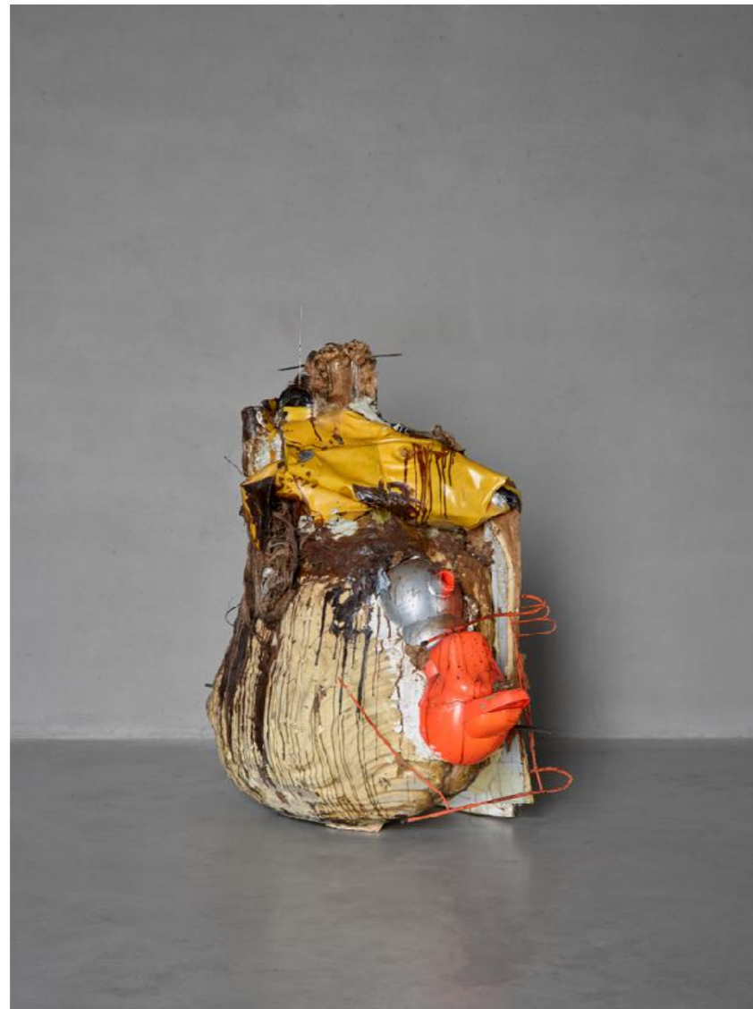
I am the Tablet , 2023, Axel Vervoordt Gallery, Kanaal, Wijnegem, Belgium.

The sculptures in the series Gorgo consist of fabric, horse hair, and black animal blood. The inclusion of material of animal origin refers to the existential tension of being between fragility and constant change. The Gorgo (Gorgon) is a horror-figure from the myth of Medusa. Her snake covered head in ancient art was supposed to protect by making an unbearable reality visible in reflection. This series in particular can be linked to the term “abject,” what the body has excreted, discarded, and suppressed that in our reality appears horrific, but in profound psychological terms still has an impact and an influence.