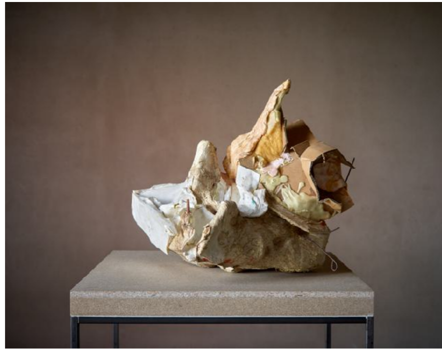
Investigation of Materiality, 2021, Axel Vervoordt Gallery, Kanaal, Wijnegem, Belgium.