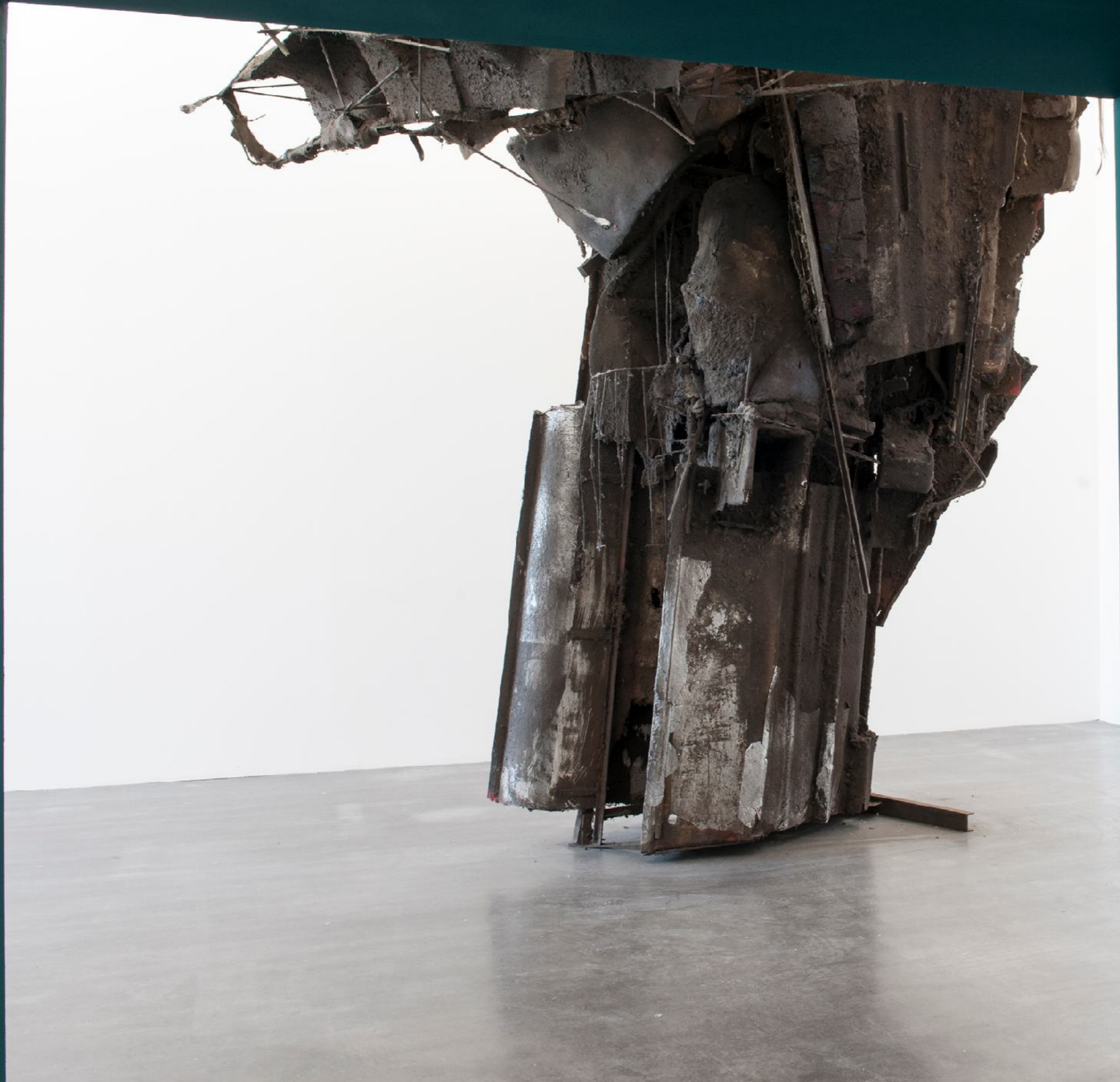
Risquons-Tout , 2020, WIELS, Brussels, Belgium