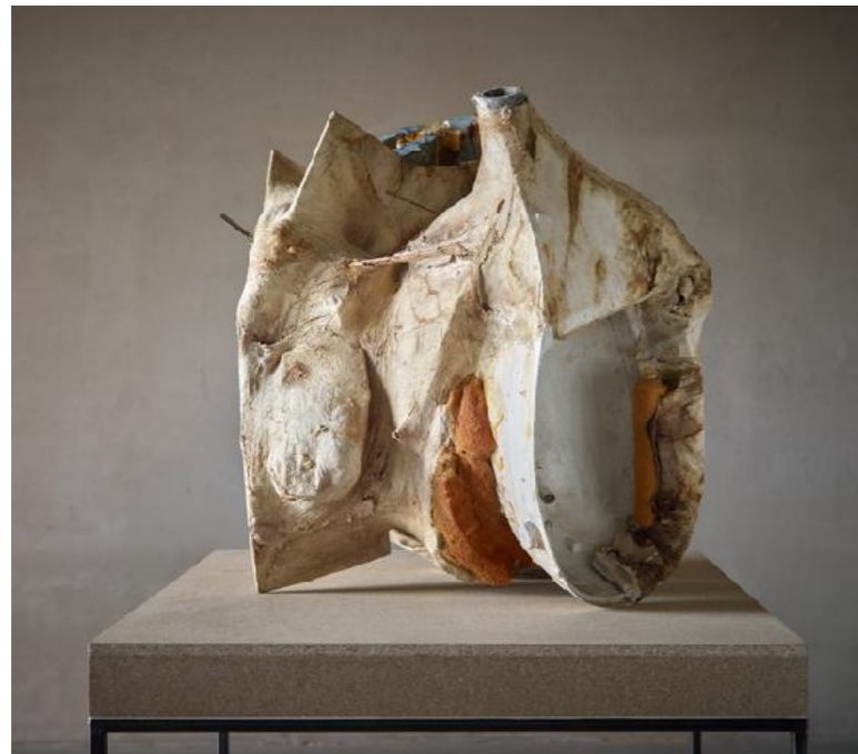
Investigation of Materiality, 2021, Axel Vervoordt Gallery, Kanaal, Wijnegem, Belgium.

Since 2019, Peter Buggenhout has made a series called Mute Witness : wall objects that approach three-dimensional images in a refined way, since only the textile outside can be recognized, and that have something surprisingly narrative about them. Whether something happened beneath the draped cover might well trigger the imagination of the beholder even more than other sculptural events created by Buggenhout. But as the title says, this witness remains mute.