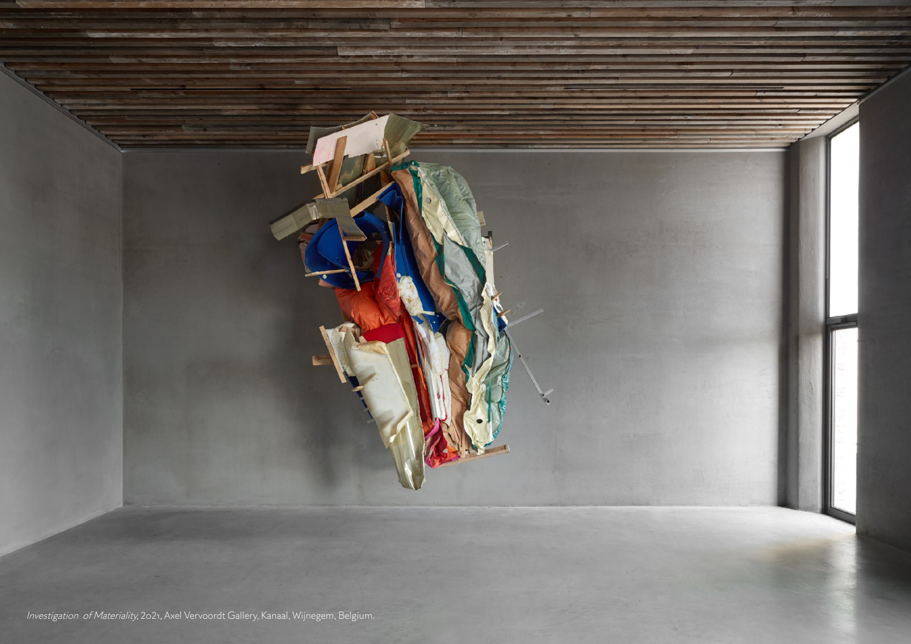
Investigation of Materiality, 2021, Axel Vervoordt Gallery, Kanaal, Wijnegem, Belgium.