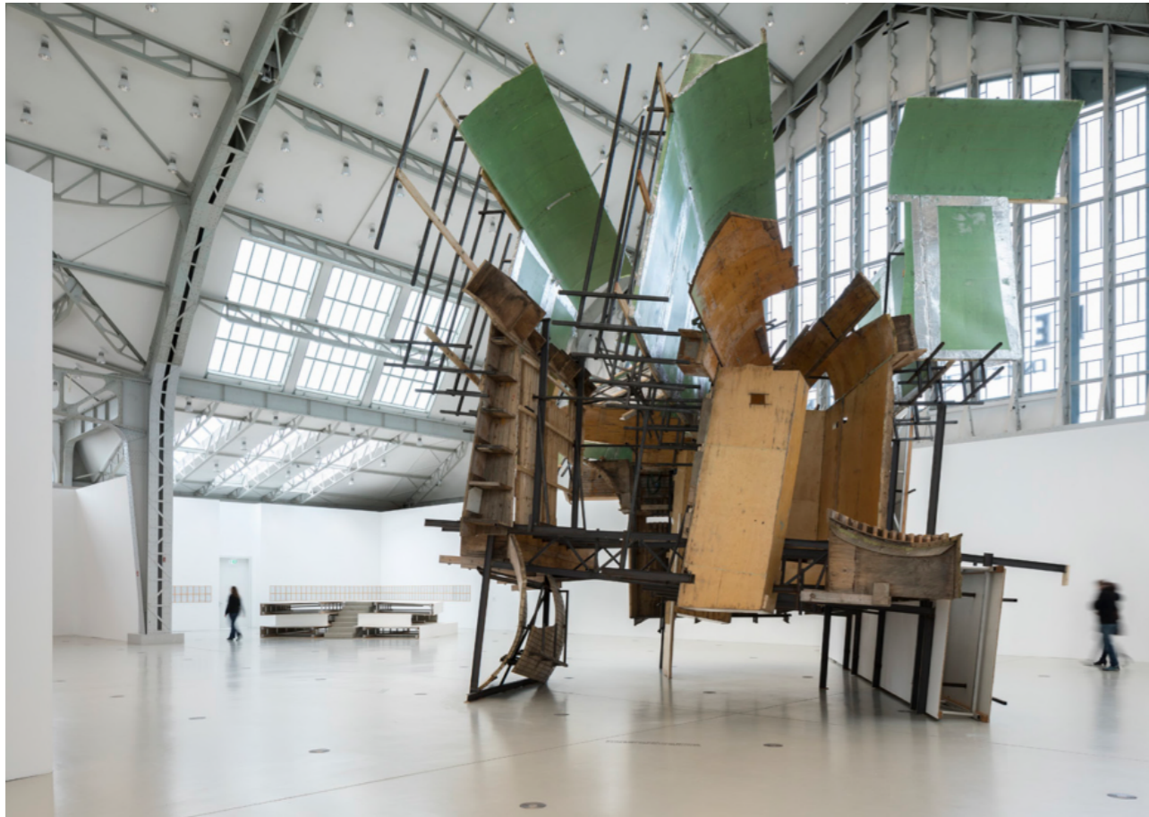
Elbphilharmonie Revisited , 2017, Deichtorhallen, Hamburg, Germany.