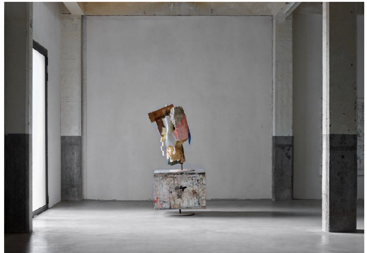
Layered Realities, 2024, Axel Vervoordt Gallery, Kanaal, Wijnegem, Belgium.

In Mont Ventoux , Buggenhout refers to the very first description of a mountain climb, written by Petrarch in 1336. At the apex of Mount Ventoux, he cast his glance across the nature that had been overcome, pulled out his copy of St. Augustine and began reading about the sins of visual desire. The epochal link of aesthetic and contemplative views, triggered by this new experience of the world, is also reflected in this group. Buggenhout amplifies the sensory impressions using various materials, forms, colors, and surfaces: bleached animal guts, painted and raw artificial materials, cardboard, metals and wood form open and block-like complexes that offer new views from every perspective. Since these groups in particular demand to be viewed while moving, Buggenhout created for the mid-sized format Mont Ventoux pieces plinths. As part of the artwork, they appeal to the beholder to explore the variety of the world in miniature by walking around the work in the alternation of silhouettes and individual shapes.