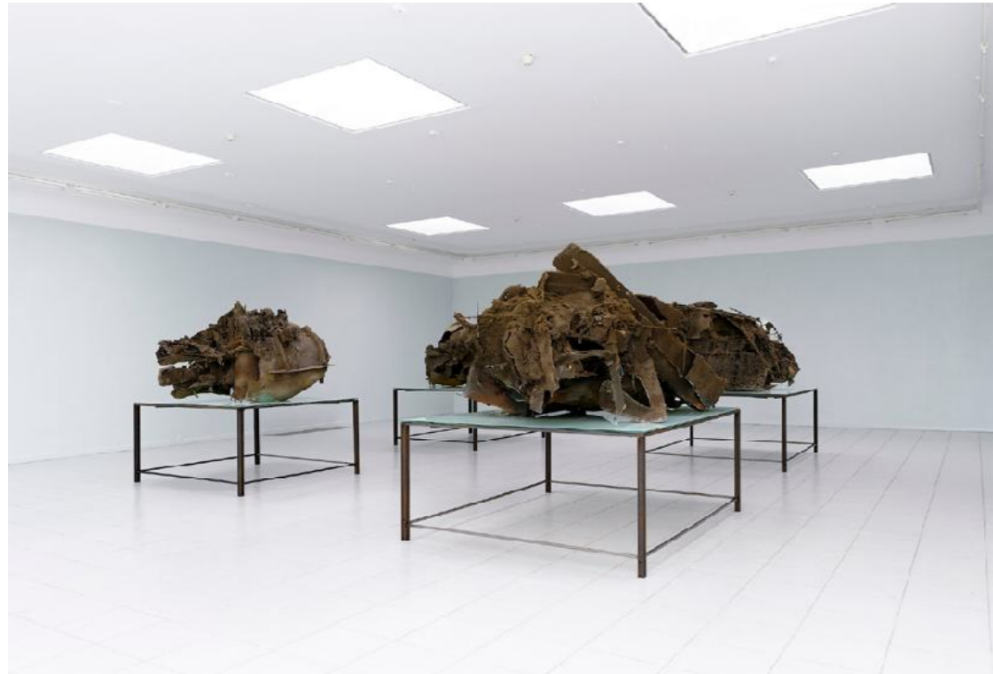
Museum Dhondt-Dhanens, Deurle, Belgium, 2009.

Buggenhout works systematically and over the long term on several consistent series that are best identified by the materials used. They are impossible to describe exhaustively in formal terms due to their amorphous complexity. Their titles are each taken from parables, myths, or motifs in which perception is delayed, negated, or mirrored. Different ways of reading the world illustrate the tense relationship between the visible and the utterable, and ultimately between the artwork and the word.