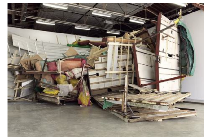
Inside , 2014, Palais de Tokyo, Paris, France.

In his On Hold series, Peter Buggenhout combines large inflatable, organic shapes intertwined with rigid constructive materials that both support and restrict them amid their expansion. Formally, the sculpture indicates a state of incompleteness and instability, embodying the concept of unfixed identity. The result is an accumulation of brutal, yet brightly coloured materials and objects stripped from their original context and forced/squeezed into a complex composition that pushes the viewer towards confusion and disorientation through a sense of blurred recognition. Underneath a seeming turmoil of composition lies a carefully considered logic that is an equivalent representation of the elements and events, the complex reality that surrounds us.