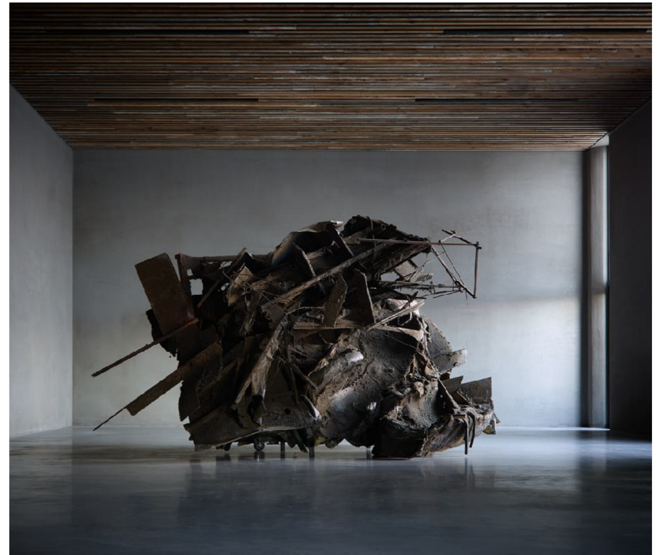
... use menace, use prayer... (part II) , 2019, Axel Vervoordt Gallery, Kanaal, Wijnegem, Belgium.