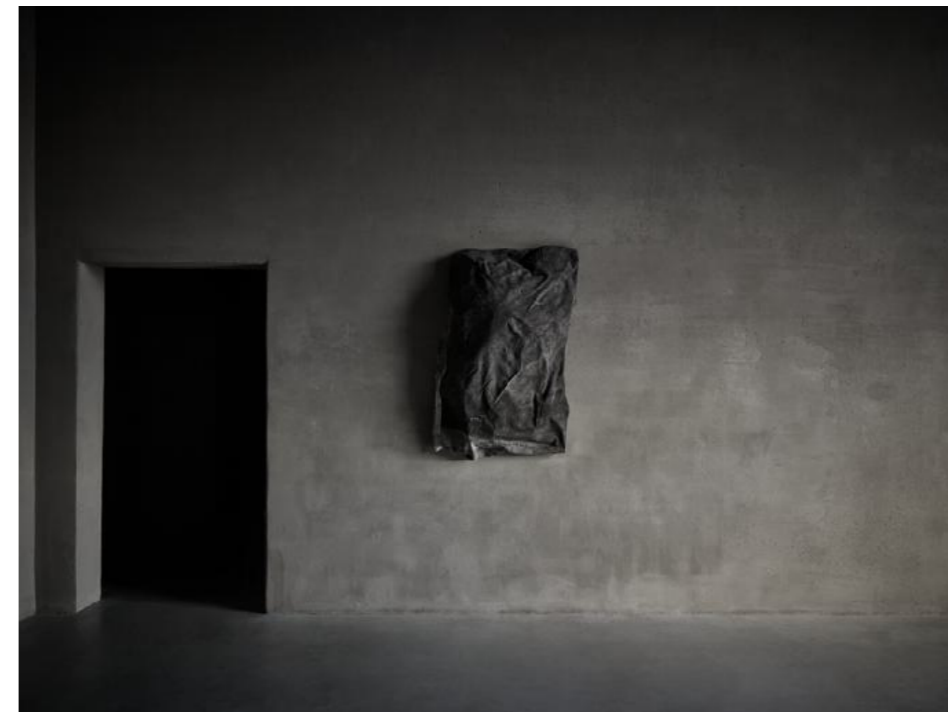
... use menace, use prayer... (part II), 2019, Axel Vervoordt Gallery, Kanaal, Wijnegem, Belgium.

Since 2019, Peter Buggenhout has made a series called Mute Witness : wall objects that approach three-dimensional images in a refined way, since only the textile outside can be recognized, and that have something surprisingly narrative about them. Whether something happened beneath the draped cover might well trigger the imagination of the beholder even more than other sculptural events created by Buggenhout. But as the title says, this witness remains mute.