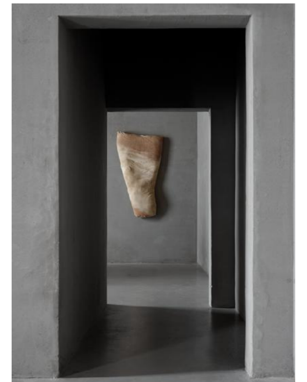
I am the Tablet , 2023, Axel Vervoordt Gallery, Kanaal, Wijnegem, Belgium.