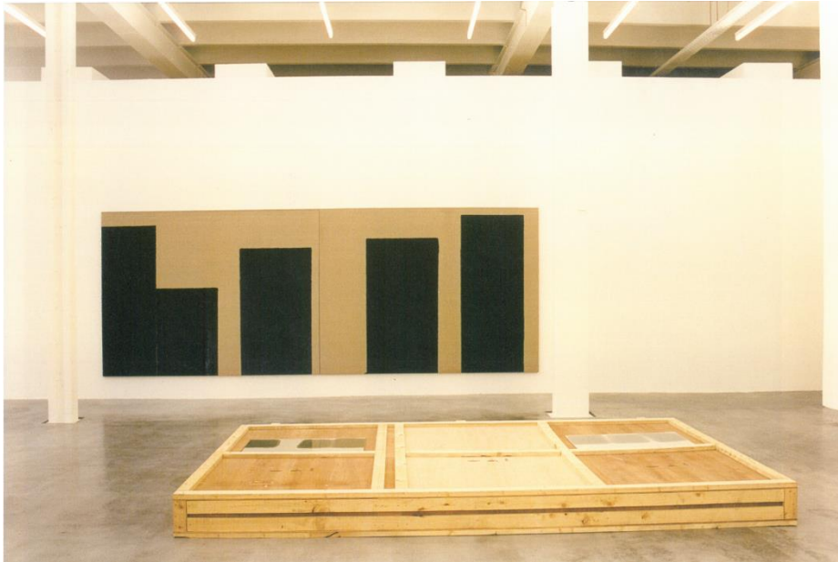
Installation view of Hyong-Keun Yun's solo exhibition at Stiftung für Konkrete Kunst, Reutlingen, Germany, 1997.