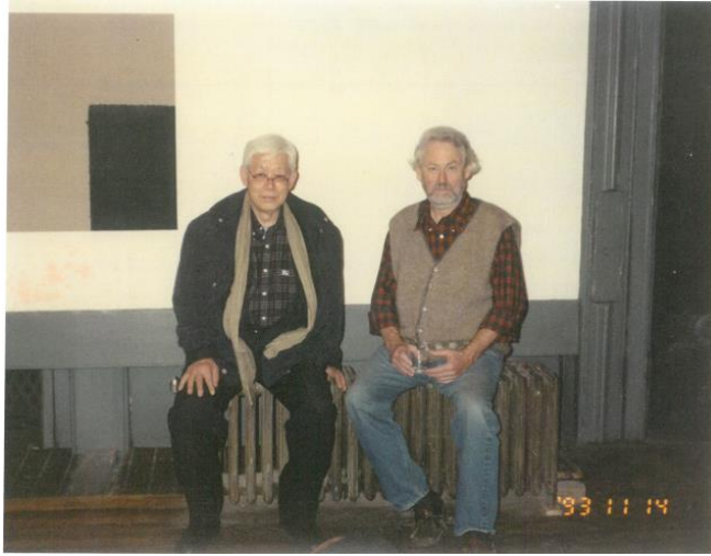
Yun Hyong-Keun with Donald Judd at the Donald Judd Foundation in New York, 1993.